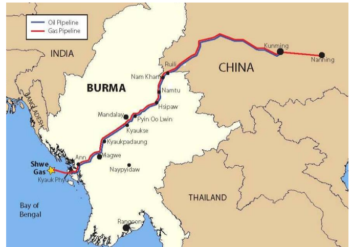
Map of the Shwe Gas Project